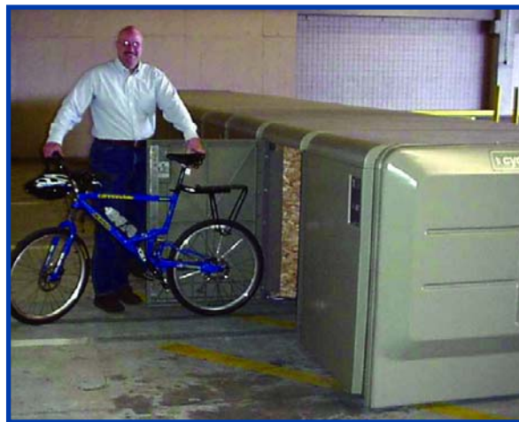
Cycle-Safe and the City of Phoenix, working together to provide secure storage for bike commuters

The City of Phoenix is the epitome of a bike friendly community. 470 miles of on street bike lanes and off road trails embellish the city's landscape, bike racks have been added to busses, tunnel systems and freeway overpasses specifically designed to keep cyclists from conflicting with motorized traffic have been put in, and a program to recycle bikes and redistribute them to low income families for basic transportation has even been implemented. Moreover, in order to keep improving upon their bike friendly reputation they have installed 22 bike lockers at the local City Hall for employees to use.