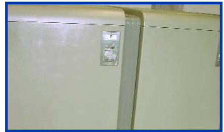
The City of Phoenix uses Cycle-Safe lockers in unused areas of the parking garage, maximizing parking potential.