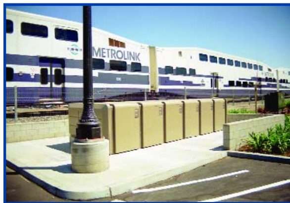
Cycle-Safe ® double access bicycle parking provides complete protection for 12 Metrolink riders bicycle equipment 24/7

C ycle-Safe, Inc., a leading supplier of secure bicycle storage and environmental management systems, recently shipped 22 of their bicycle lockers to the Santa Clarita, California community of Newhall to be installed at the new Jan Heidt Metrolink station by Terra-Cal, a California-based general contractor.