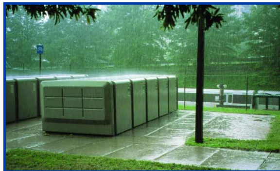
Cycle-Safe Bicycle Lockers provide shelter & security for Washington Metro commuters.

Cycle-Safe lockers have met all our requirements, Vogel says. “They’re low-maintenance & perform extremely well.”