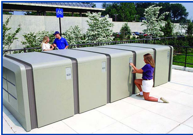
Stylish Cycle-Safe Bicycle Lockers blend in with Washington Metro's landscape