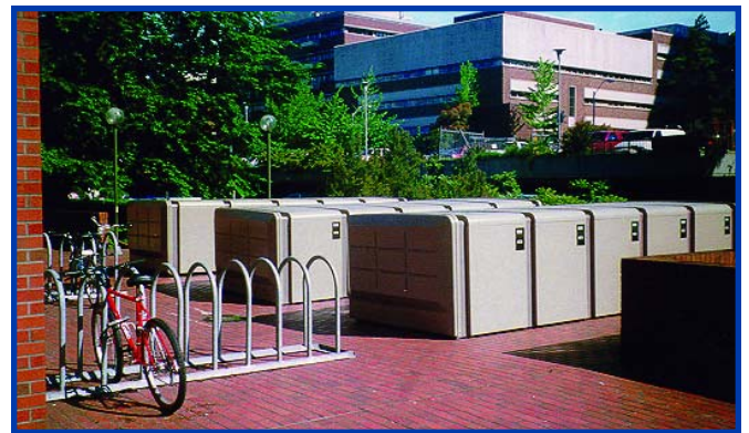
Attractive and functional, Cycle-Safe lockers accent and blend in with the existing campus environment

Bicycling and Cycle-Safe lockers are a critical part of the university's award-winning U-Pass transportation management program. Established in 1989, the program was the result of an agreement with the City of Seattle to develop a master plan that creates alternatives to the single-occupant automobile trips to and from campus. Because many of the university's 55,000 students and staff commute from off campus locations, the alternatives are necessary for the university to comply with laws mandating reduced auto-related air pollution, energy consumption, and traffic congestion. . In addition to bicycling, the plan includes reduced mass transit passes, van/carpools, a cap on